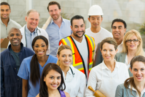
Getting a Job