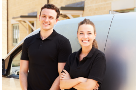
Getting into Self-employment