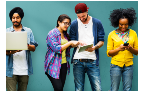
Choosing subjects and courses at 18